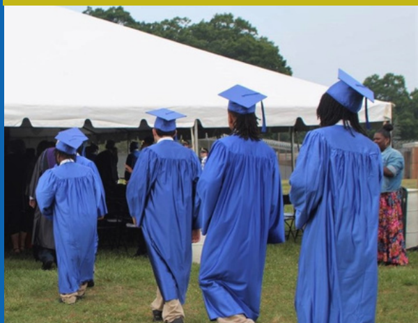
The candidates for graduation march in procession to the event tent.

“At first, school wasn’t in my mind or even part of my plan. I realized that my future depended on me having an education, and it started with a diploma,” he said, challenging his classmates to embrace the change their accomplishments helped them to make, and to go forward with their heads high, proud of themselves and all they can achieve. Family and staff in attendance nodded in agreement, adding later that they found the day’s speeches not only motivational, but entertaining and thought-provoking.