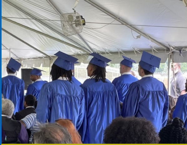
Graduates stand before turning the tassels on their caps.