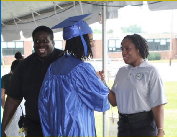
A youth is congratulated by staff after receiving his diploma.